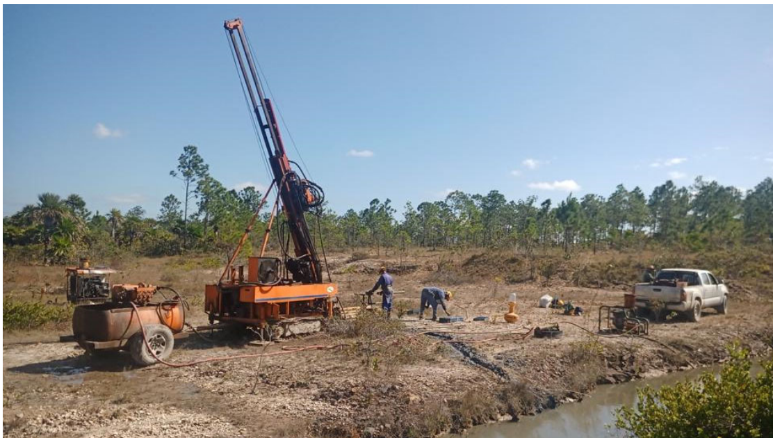
Drilling - El Pilar